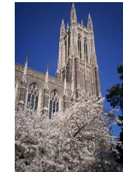
Sarah P. Duke Gardens and Duke Chapel

On Thursday, June 6, we will take a trip to Durham to tour the Sarah P. Duke Gardens, by trolley. We will have a "dutch" lunch on campus and then visit Duke Chapel. The only cost is a $10.00 charge for the gardens tour. We will leave the church parking lot at 8:15. We only have 20 tickets for the tour so please sign up by Sunday, May 26.