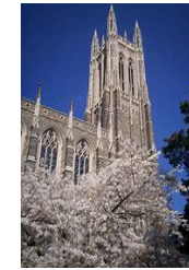
Sarah P. Duke Gardens and Duke Chapel

On Thursday, June 6, we will take a trip to Durham to tour the Sarah P. Duke Gardens, by trolley. We will have a "dutch" lunch on campus and then visit Duke Chapel. The only cost is a $10.00 charge for the gardens tour. We will leave the church parking lot at 8:15. We only have 20 tickets for the tour. Today (May 26) is the deadline to sign up.