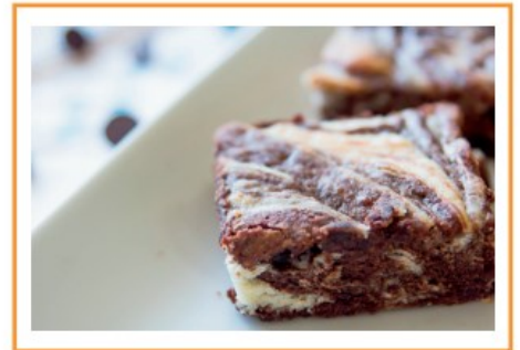
Cream Cheese Brownies A customer favorite for over 30 years these tasty, decadent brownies are swirled with cream cheese goodness. They are terrific on their own or a great ending to any one of our meals. 22oz | 1 dozen