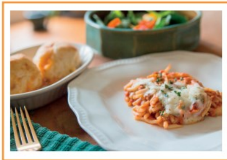
Vegetarian Baked Spaghetti A delicious and satisfying casserole filled with red sauce, spaghetti and vegetable protein. Topped with Mozzarella & Parmesan cheese and mixed herbs. 52 oz | 4 servings