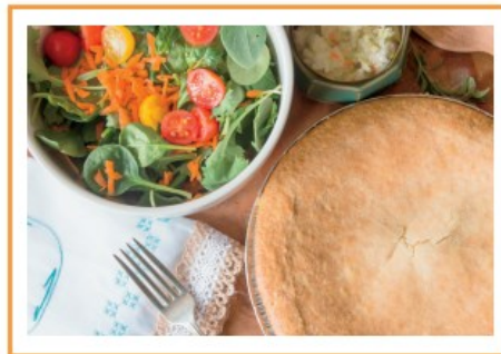
9" Chicken Pot Pie with Vegetables Our delicious Moravian Chicken Pie with the addition of peas, carrots, green beans, and corn. 32 oz | 4 servings