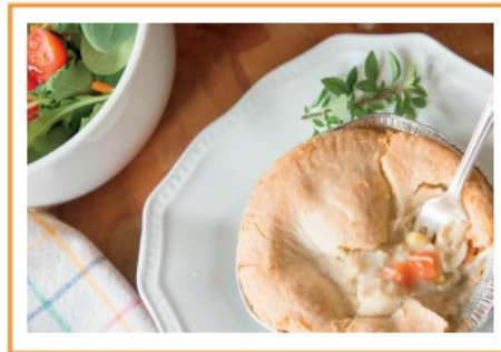
4 pack 5" Mini Chicken Pies 4 individual portions of our popular chicken pies. A great go-to meal for kids (and people) on the go. Available in Moravian and Chicken Pot Pie. 9 oz each | 4 per pack of one flavor