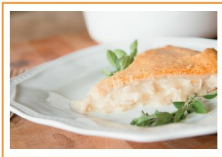
9" Moravian Chicken Pie Hearty and filling, made from scratch, filled with shredded all-white meat chicken, and creamy stock gravy. A Moravian tradition and North Carolina favorite for more than 250 years. 32 oz | 4 servings