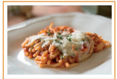
Baked Spaghetti A classic and comforting casserole filled with ground beef, red sauce and spaghetti pasta. Topped with Mozzarella & Parmesan cheese and mixed herbs. 52 oz | 4 servings